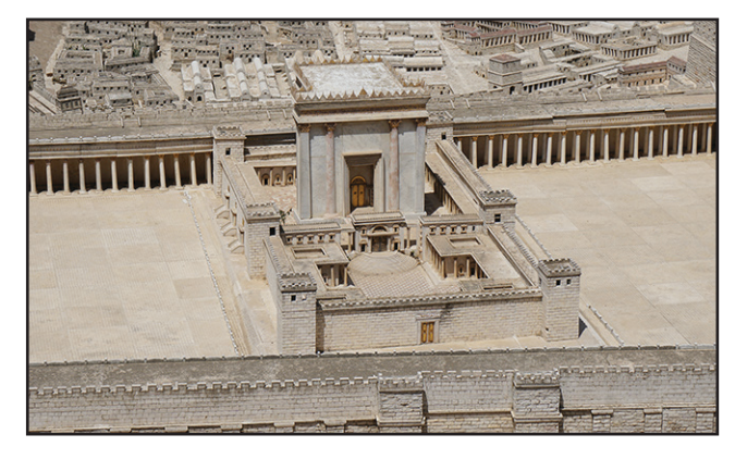
The Temple in Jerusalem was the One Place on earth sanctioned by Yahweh, God of Israel, for true worship. It was the Only Place on earth where blood sacrifices for the atonement of sins were accepted by God.

offer your burnt offerings in any place that you choose; but in the place which the LORD chooses, in one of your tribes..." This command is repeated five times in this one chapter. Where is the One Place on earth where Yahweh, God of Israel, chose to place his name? Yahweh "said to David and to Solomon his son, 'In this house [this Temple] and in Jerusalem, which I have chosen out of all the tribes of Israel, I will put My name forever" (2 Kings 21:7).