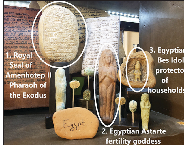
This is the Egyptian Display in the Solid Rock Café, Bible Museum, 96 E Center, Ephraim, UT

be killed at birth. For this sin God said, “Israel is My son , My firstborn. So I say to you, let My son go that he may serve Me. But if you refuse to let him go, indeed I will kill your son, your firstborn” (Exodus 4:22-23).