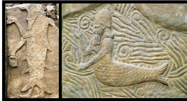
Two ancient stone reliefs of Dagon, the sea god.

was found, once again, face down before the Ark of Yahweh, but this time his head and both hands were broken off.