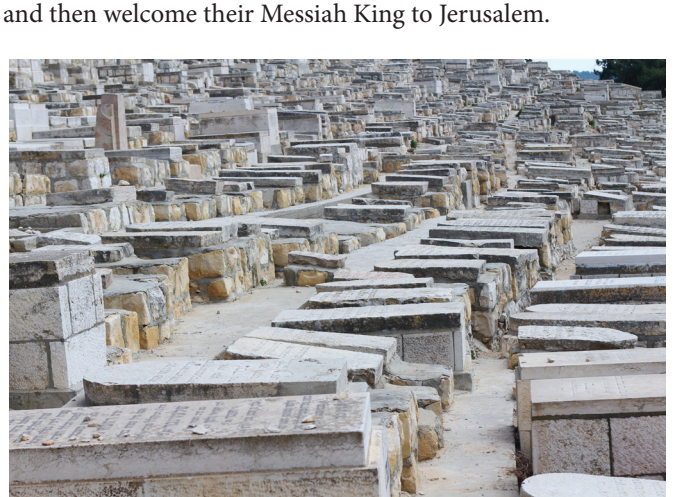
In the first picture you can see the size of this cemetery, it is HUGE. In this close view you can see how the Jewish graves are situated on the mount.

the Messian will resurrect all of numanking and set up his earthly kingdom in Jerusalem. The deceased Jews buried on the Mount of Olives hope to be amongst the first to resurrect