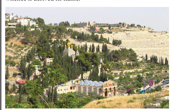
The green hill marked with Christian Churches including the light colored slope in the distance is the Mount of Olives. The light colored slope is a huge Jewish cemetery.

The Mount of Olives is the ridge that runs north to south on the east side of Jerusalem. According to the Bible, it is 'a sabbath day's journey' (about a ¾ of a mile walk) to the east of Jerusalem. In Biblical times it was covered with an olive grove from whence it derived its name.