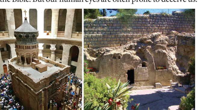
On the Left is the Tomb of Jesus in the Church of the Holy Sepulcher. On the Right is the Garden Tomb near Gordon's Calvary.

ly drawn to Gordon's Calvary because the rocky outcrop resembles a skull. And when looking at the tomb options, it is the Garden tomb that seems to best match the description in the Bible. But our human eyes are often prone to deceive us.