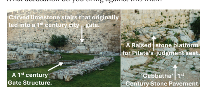
This Gate, Stone Pavement, and Throne Platform identify Gabbatha.

The Praetorium was only about a block north of the House of Caiaphas. The Jews would have taken Jesus outside of the city to meet with Pilate at his private gate that led into the Praetorium. In John 18:28-29 we read, "Then they led Jesus from the house of Caiaphas to the Praetorium... But they themselves did not go into the Praetorium... Pilate then went out to them and said, "What accusation do you bring against this Man?"